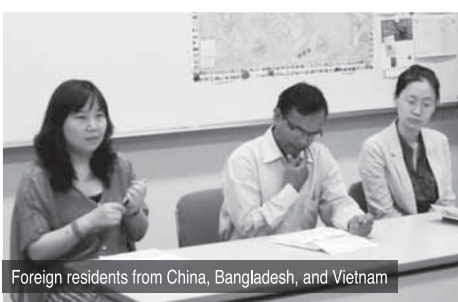
Foreign residents from China, Bangladesh, and Vietnam

We invited three of Kanazawa's foreign residents, and asked them about the following topics: