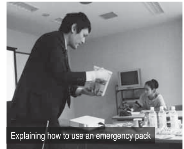
Explaining how to use an emergency pack