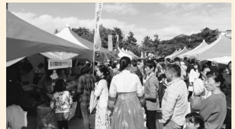
Enjoy the festival's nearly 40 food, drink and merchandise booths, and meet people from around the world!