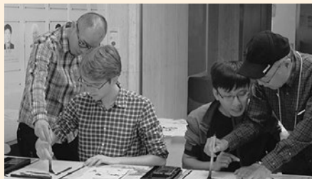
Festival participants enjoying shodo, Japanese calligraphy.