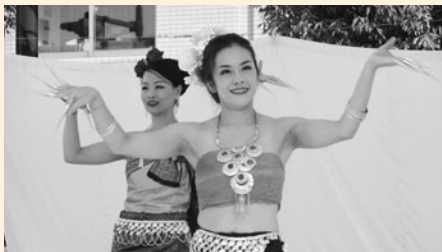
World stage where you can enjoy various music and dances from around the world!

We hope you will join us and meet many people from different cultures throughout this two day extravaganza!