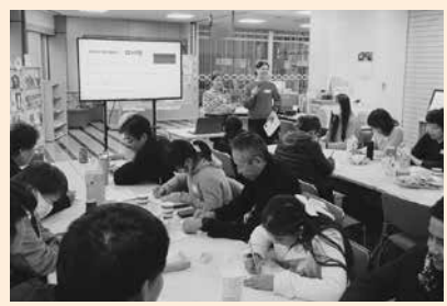
Let's Learn Russian