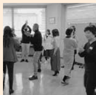
Playing a Game

On Sunday 17 December, the nine children studying at the Children's Japanese Language Plaza, their families and 12 volunteers gathered for lunch, games and a language lesson. The volunteers learned greetings from the children's first languages. The children seized the chance to become teachers and made an impressive effort to explain everything in Japanese. This role reversal gave the volunteers a new appreciation of their students, providing insight into how difficult it is to learn a foreign language.