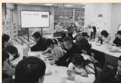
Let's Learn Russian